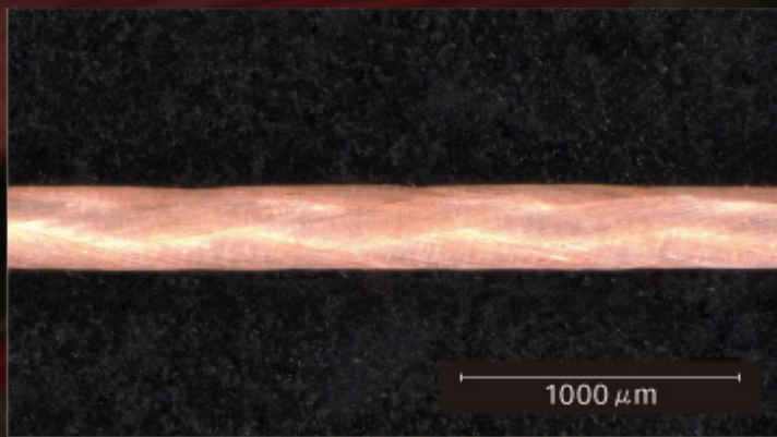
Our 8-strand PE line.